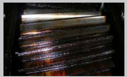
Before Pyroshield Conversion