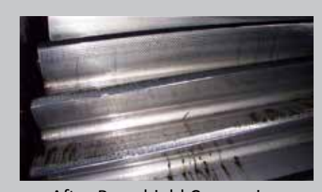
After Pyroshield Conversion

Unlike some open gear lubricants (top), Pyroshield is translucent in service (bottom), making gears easy to visually inspect. Pyroshield has a higher viscosity than most competitive products, and at the same time will not build up on itself or cause spray nozzle or lube system problems.