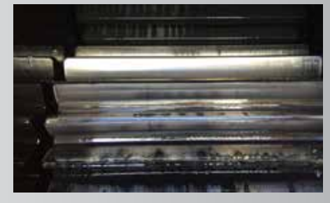
Clear, flowing Pyroshield 9011 is lubricating these ball mill open gears, making it easy for the operator to visually inspect with a strobe light during operation.

LE Solution: Pyroshield lubricants are extremely tacky and cling to metal without buildup. Pyroshield is translucent once applied, allowing for a visual inspection of the gear surfaces. With high-viscosity Pyroshield, LE customers have been able to reduce the amount used, which means a reduction in lubricant consumption, cleaning and waste disposal.