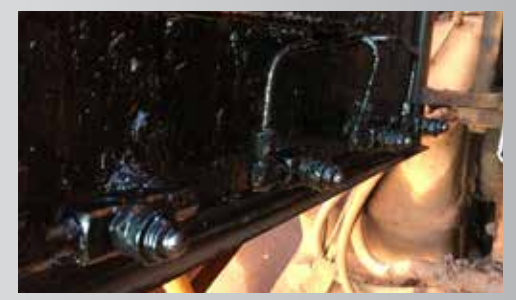
The spray nozzles on this open gear lubrication system remain clean and free of clogging while applying Pyroshield.

Converting ball mills and kilns is simple using LE's proven, effective and safe procedure that provides no interruption in production or operation.